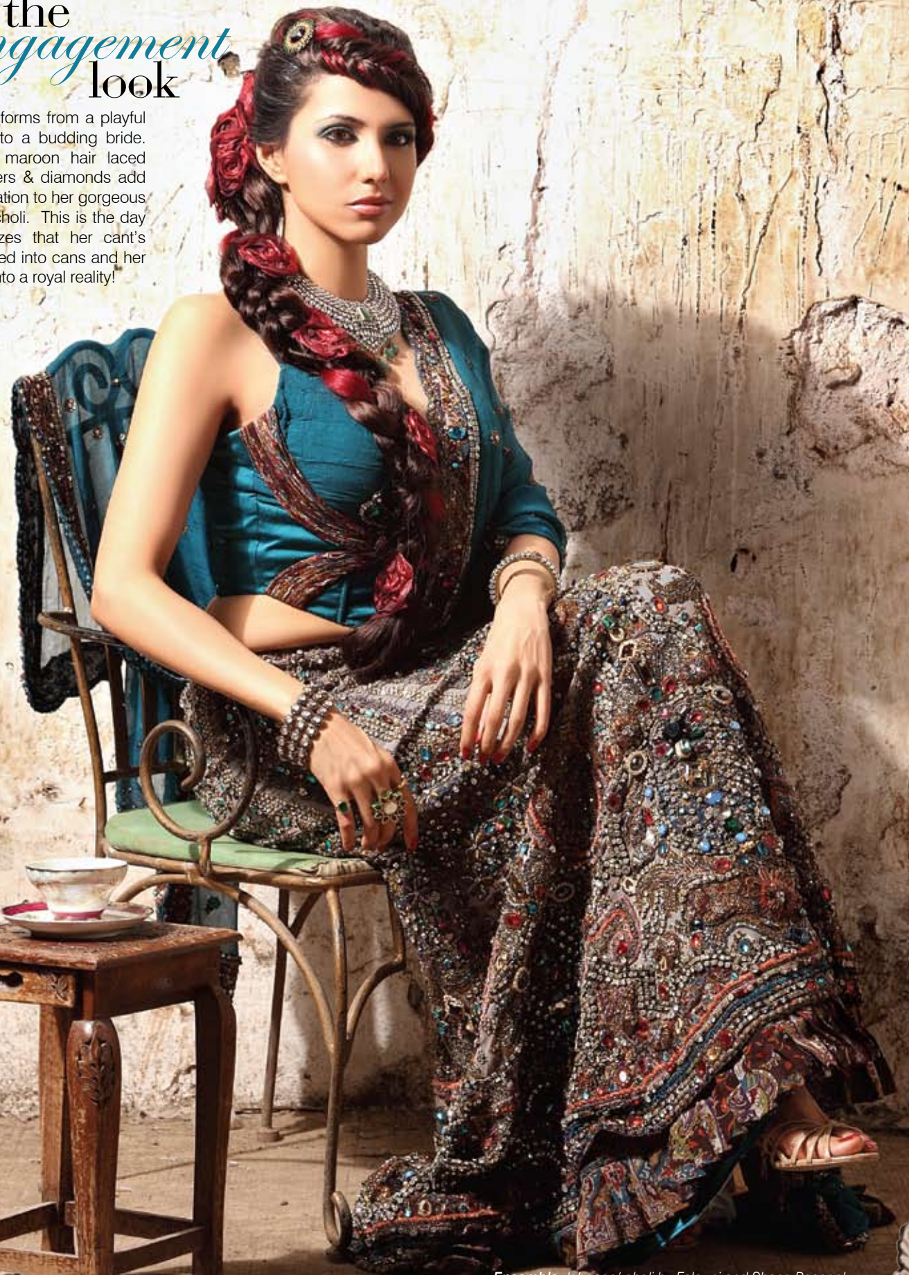
Ensemble: lehenga/ choli by Falguni and Shane Peacock, Necklace and bracelet - Aquamarine, Ring and kadas - Curio Cottage, and Shoes & props: Stylists' own

She transforms from a playful beauty into a budding bride. The rich maroon hair laced with flowers & diamonds add sophistication to her gorgeous lehenga/choli. This is the day she realizes that her can't's have turned into cans and her dreams into a royal reality!