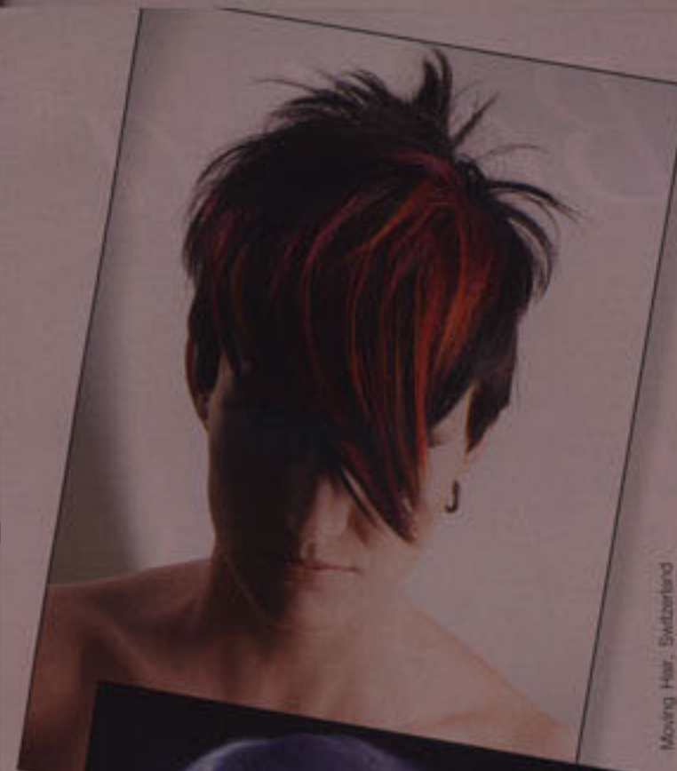
Moving Hair, Switzerland