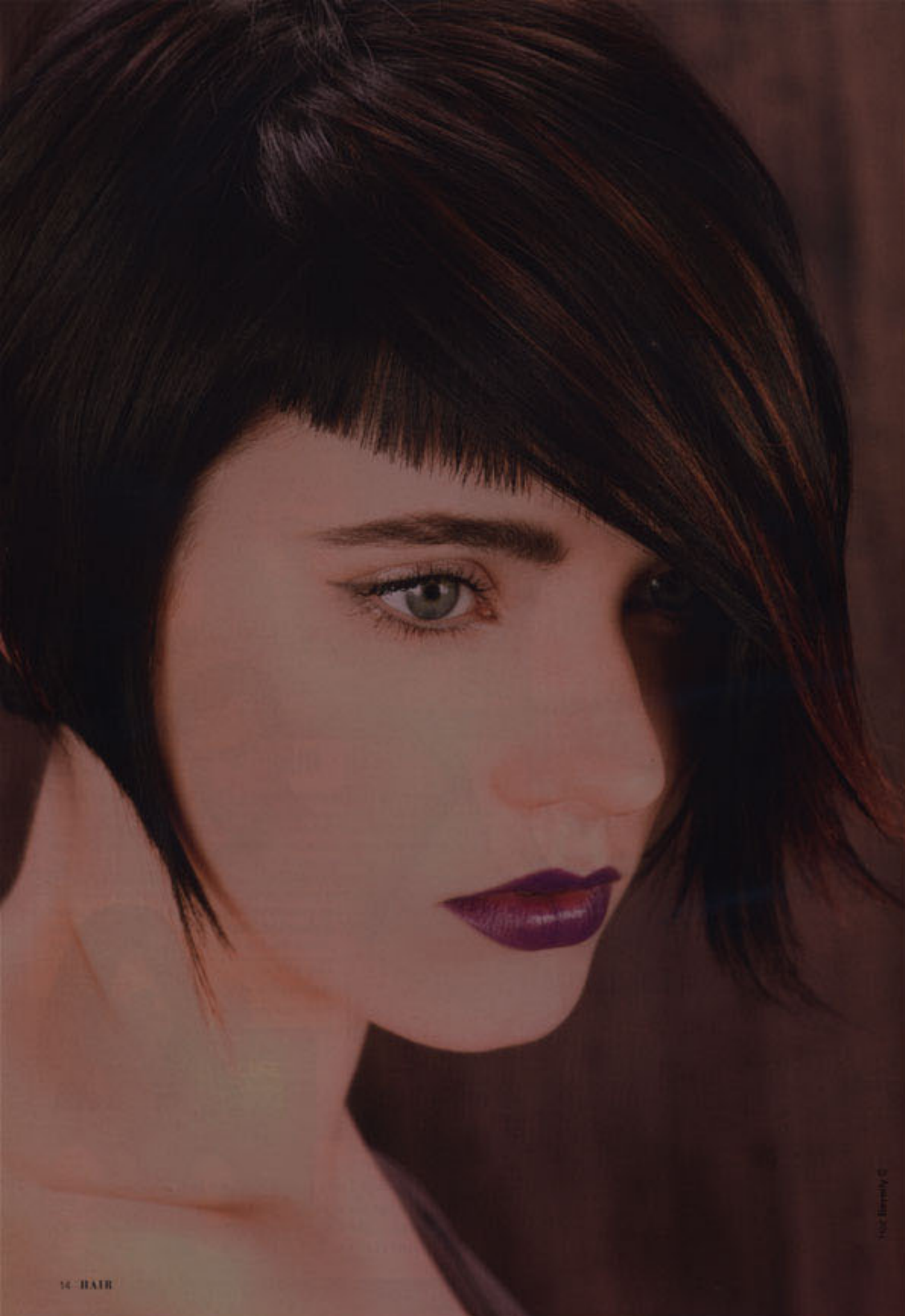
Nad Baranoff ©